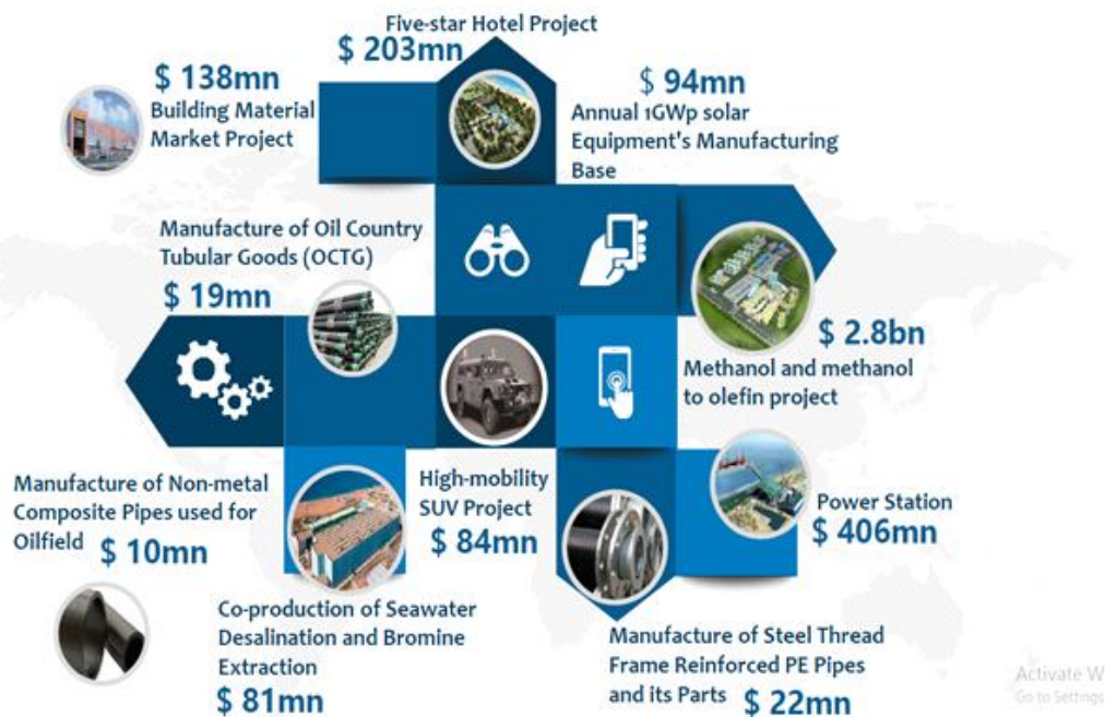
Figure 3. The first 10 Projects of China-Oman (Duqm) Industrial Park