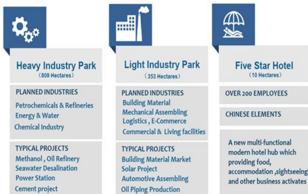
Figure 2. The Planned Industries in China-Oman (Duqm) Industrial Park

Refinery and Petrochemical Industries Company will provide development opportunities for new projects that will interface with the refinery. These projects will benefit from the refinery's products and in return they will provide different logistic services to the refinery. The company will adhere to the international standards and therefore giving Duqm a name and brand as a major player in the field of Petrochemical industries 4 .